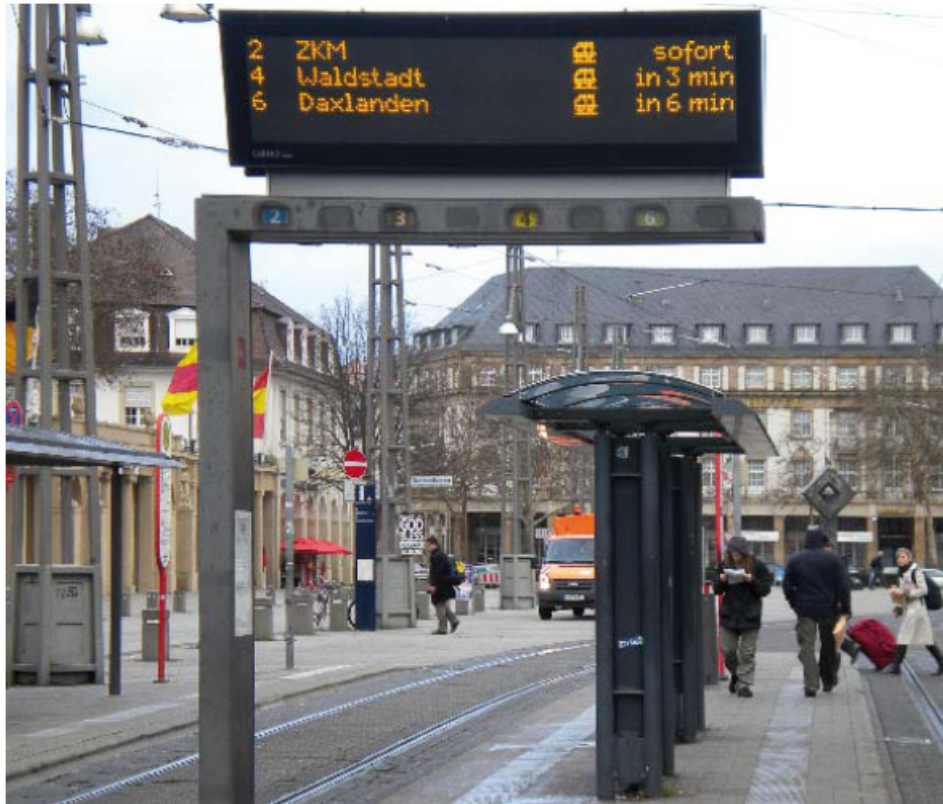
↑ | Station square