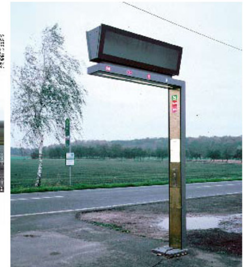
↑ | Prototype ↓ | Tramway station