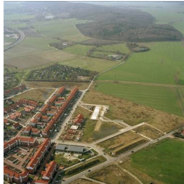
building securing the garden