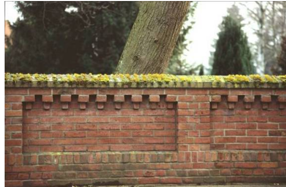
building as simple as the enclosure of the garden