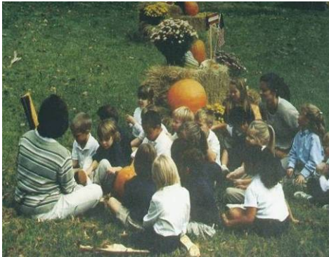
kinder- garden as the ideal space